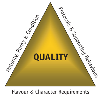
The Winegrape Quality Triangle

A useful model with which to consider grape quality is the Quality Triangle which, for the purposes of grape transactions, groups all the factors that can influence grape quality into three 'legs' of a triangle.